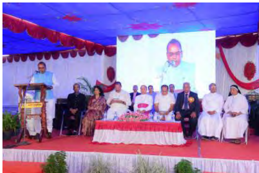
Welcome by Chairman of Committee