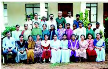
Manasa Staff 1997