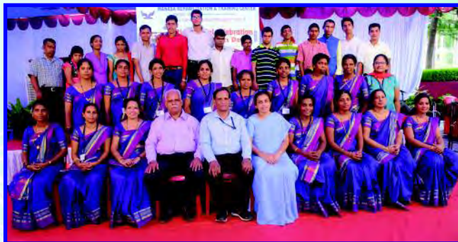
Alumni with staff