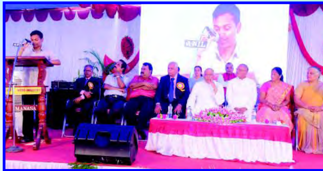
Feed back by Alumni