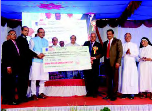
18 laks donation by SWAK to Manasa