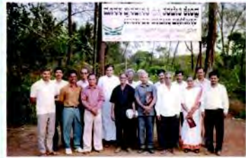
Shifting of Manasa Schools of Shirva and Shankarpura to Manasa Centre Pamboor June 1997