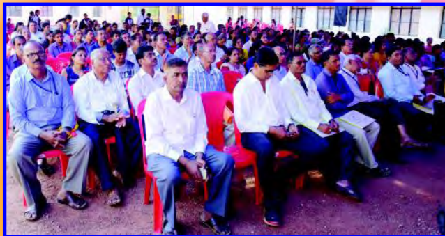
Delegates and Participants