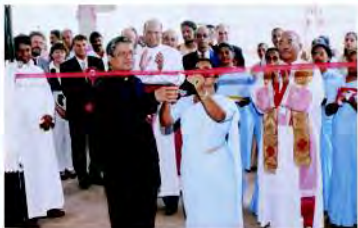
Inauguration of Manasa Centre on 14-11-1997