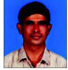
ಶ್ರೀ ಮಾರುತಿ ಪ್ರಭು