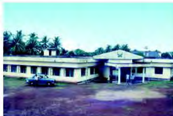
Manasa School 1997