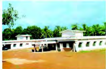
Manasa Hostel 1997