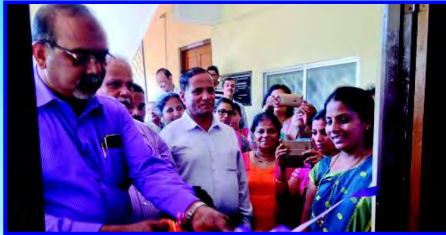
Inauguration of Exhibition