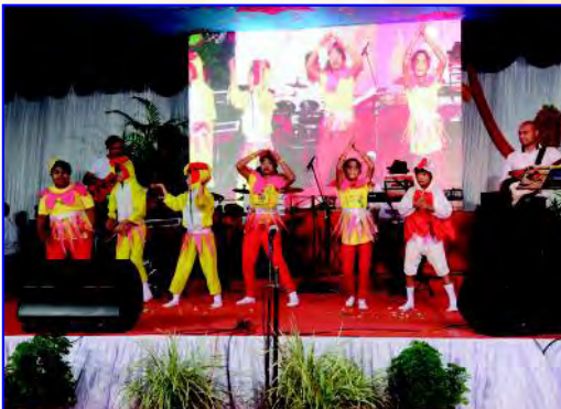
Dance by Manasa Students