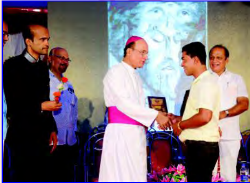
Honouring Alumnus Artist