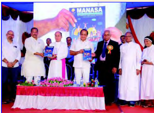
Release of Souvenir