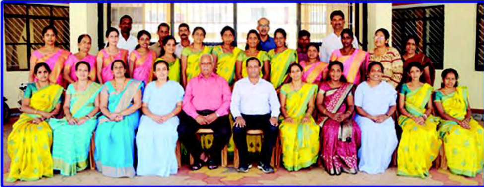
Teaching & Non Teaching