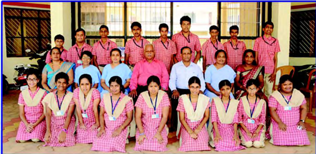
Computer Data Entry Section