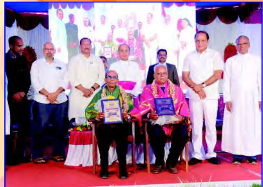
Honouring Founder President & Present President