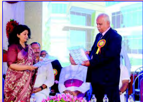
R & D Centre Inauguration