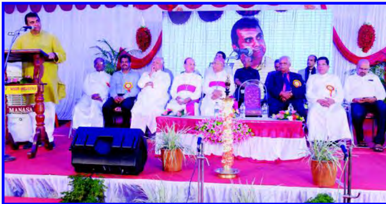
Message form Hon'ble Minister Mr Pramod Madhwaraj