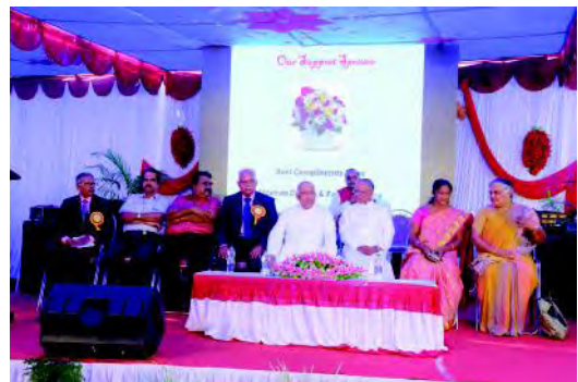
Guests of Alumni day

On 11.11.2017 Saturday morning Alumni Meet organized where the present and old students and parents had a get together. After the Flag hoisting and march past by Manasa Special Children various games were conducted including fancy dress competition. Winners were given prizes. The success stories were shared by the old students and their parents and the moment was